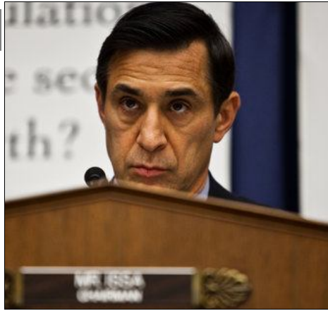
California Congressman Darrell Issa is one of the wealthiest members of congress. He is also one of the most anti-worker law makers in the House.

Not Darrell Issa. His congressional district office in Vista, CA also serves as his private business office, where he oversees a financial empire worth hundreds of millions of dollars. Issa has bought office buildings, split a holding company into separate multi-million-dollar businesses, started an insurance company, traded hundreds of millions of