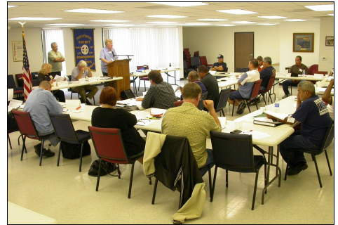
Delegates from 16 Affiliated Local Lodges gathered for the third quarterly Delegate Body meeting in Huntington Beach on July 16, 2011.

against them. We filed their petition on March 31st, and held our Vote YES blitz from May 5th through May 7th and we secured a 60% showing of interest, which was enough to proceed to election on May 12th. The company threatened to shut the plant down and lay everybody off if they voted for the union, but the workers promised to vote 'yes' in spite of these threats. A few days before the election the company removed one of the machines from the shop, and they sent in a group of people to walk around the shop with clip boards measuring tapes. The company's last-ditch effort worked, and the workers lost their election 94 to 61."